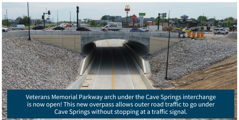
Veterans Memorial Parkway arch under the Cave Springs interchange is now open! This new overpass allows outer road traffic to go under Cave Springs without stopping at a traffic signal.

The new Veterans Memorial Parkway arch underneath the Cave Springs interchange is now open! This changes how Veterans Memorial Parkway connects to Cave Springs Road. The signalized intersection at Veterans Memorial Parkway and Cave Springs Road has been removed and converted to right-in right-out intersections. This means traffic no longer has to stop at a signal at Cave Springs and Veterans Memorial Parkway.