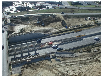
» Cave Springs Interchange in December 2022

We've made a lot of progress on the I-70 Cave Springs to Fairgrounds Design-Build Project since work began a year ago. Take a look at some of our progress.