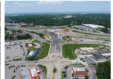
» Zumbahl Interchange in June 2023