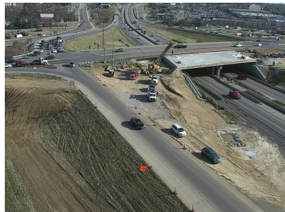
» Zumbahl Interchange in December 2022