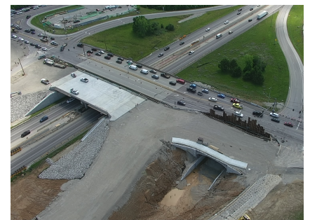
» Cave Springs Interchange in June 2023